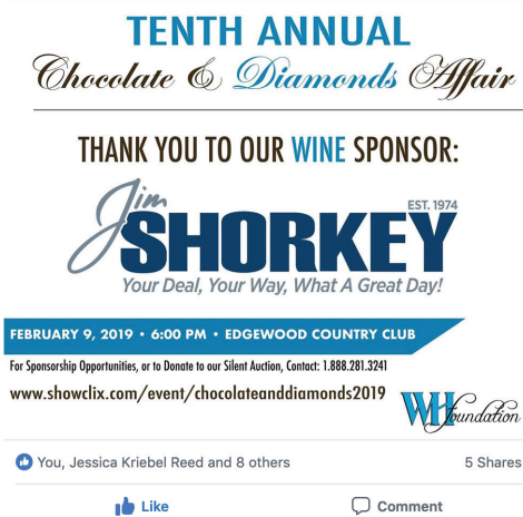
Actual Facebook Post