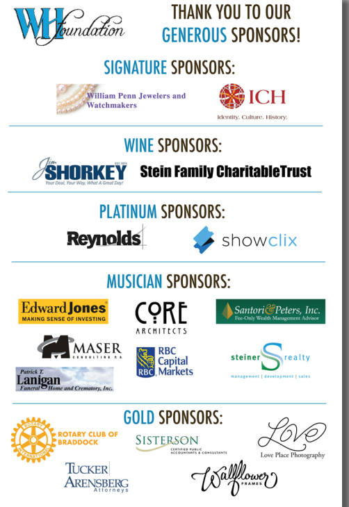
Sponsor Signage During the Affair