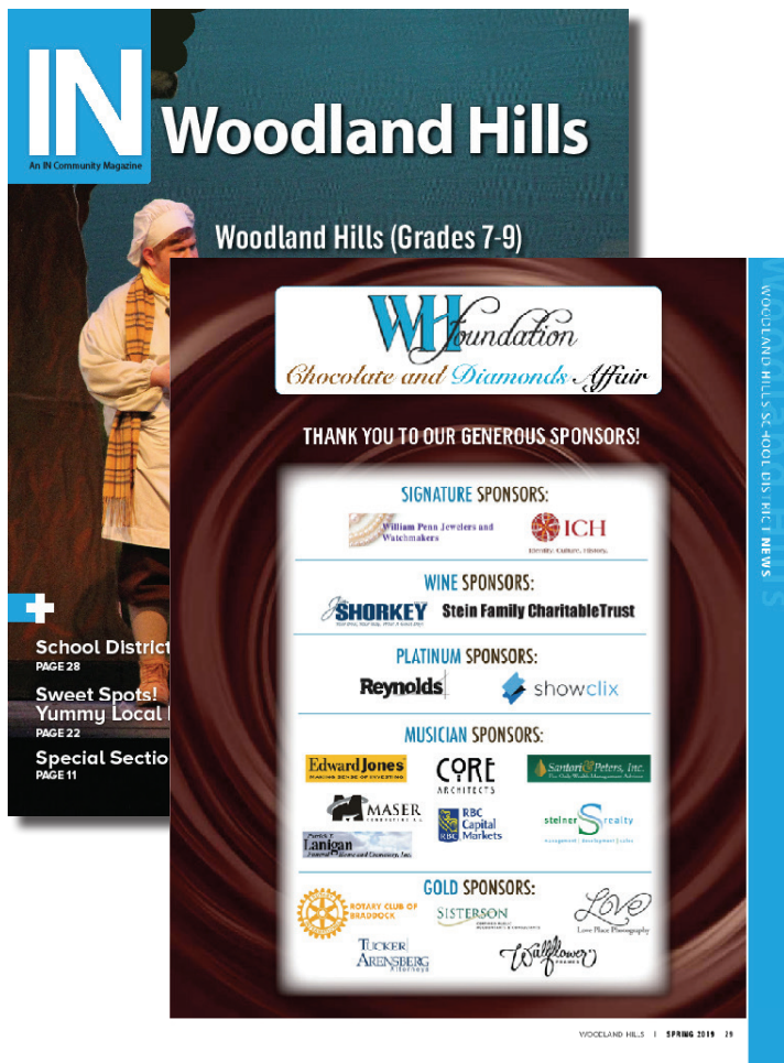
In Woodland Hills Magazine